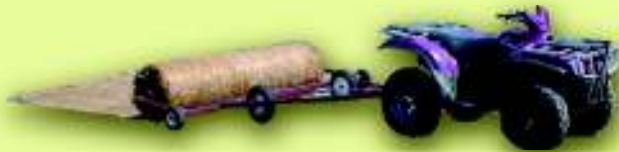
King Size Roller Bracket