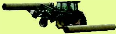
3-point or Fork Mounted Bracket, 16' Wide